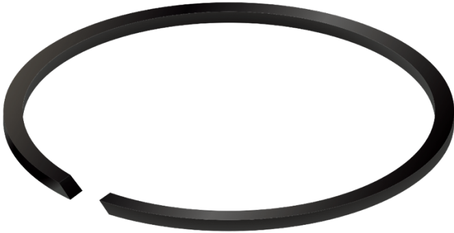
Typical backup ring with a split for easy installation

Backup rings are made of a relatively hard material. They are installed in the gland between an O-ring (or an X-ring) and the low-pressure side of the seal to prevent the O-ring from being forced into the extrusion gap.